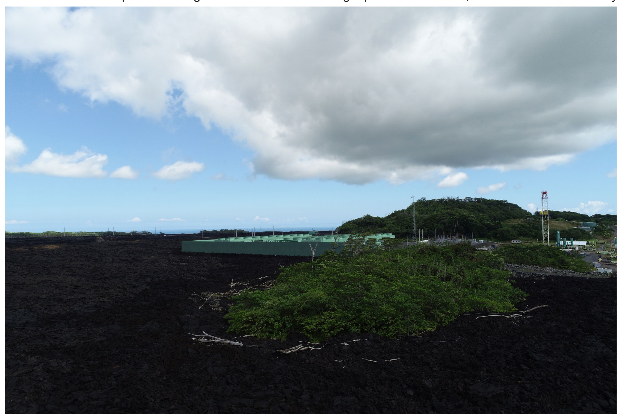
View from Viewpoint 1 with Phase 1 of the Proposed Action simulated and existing OECs removed.